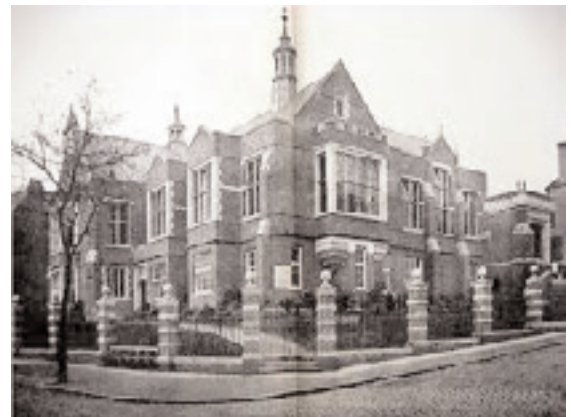
The Arkwright Road building, now Camden Arts Centre

In 1965 the new Central Library was built at Swiss Cottage leaving the old Library building in Arkwright Road vacant. At the same time the amalgamation of the three boroughs – Hampstead St. Pancras and Holborn - into Camden gave the HAC an extraordinary opportunity to establish a permanent arts centre there for both classes and exhibitions.