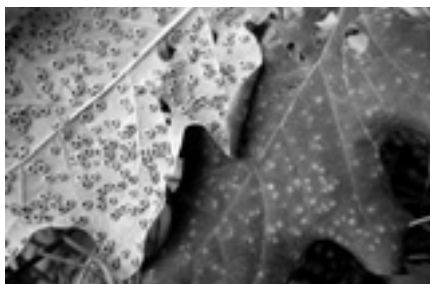
Spangle galls on oak; very abundant but the trees appear not to suffer any damage

Other trees such as decorative box, juniper and the rare Plymouth Pear also show very little genetic diversity (for the same reason – they originated as selected cuttings) making them especially susceptible to pathogens that often originate from imported saplings in tree nurseries. (Dutch Elm Disease arrived on imported elm timber.)