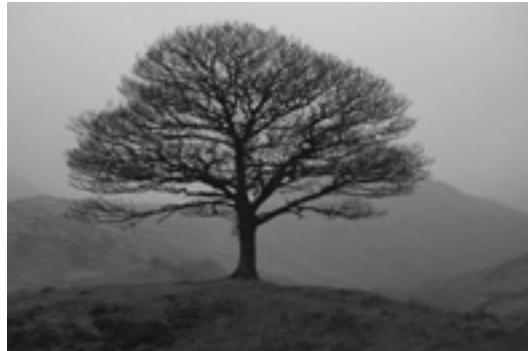
Above: Oak tree, February, Little Langdale

Scientists know that our best policy is to protect as wide a range of natural populations as possible; it is there that natural resistance to any future threats will be found. The oaks of Birk Rigg are twisted and diminutive – but they may hold genetic resources that even timber growers may need in the future.