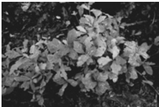
Oak seedlings Queen's Wood: start of the natural selection process

From the pollen record we know that oak soon followed the spread of birch, surprisingly it did so at a similar speed, spread by birds such as jays and by mice, as far north as Sutherland. The highest oakwoods in Britain are in the Lake District; at Birk Rigg there is a small oakwood on a steep slope ascending to 550m – though the trees are small and spreading, not tall and straight.