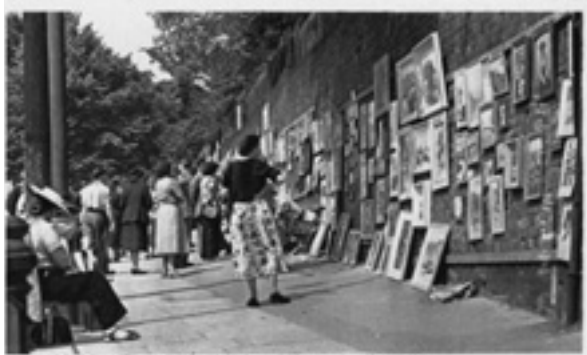
The open air art exhibition in the 1950s

Camden decided eventually that it wanted full control of the building and the art school moved in 1990 to new premises at 19-21 Kidderpore Avenue where it still works today.