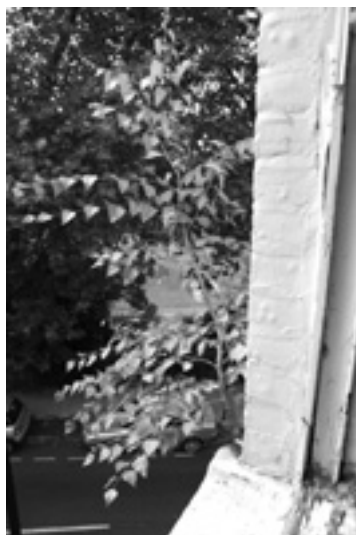
Birch sapling growing on a 'cliff' in Crouch End

few very slow-growing tiny trees like juniper and dwarf willow ( Salix herbacea ).