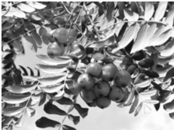
True Service fruits; St Anne's Hospital grounds

Wych Elm on the other hand is a genuine native, genetically diverse and much less susceptible to Dutch Elm Disease. It reproduces normally; fine specimens can be found especially in the north of Scotland.