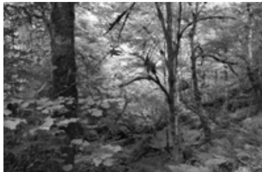
Below: Inverfarigaig: ancient broadleaved woodland