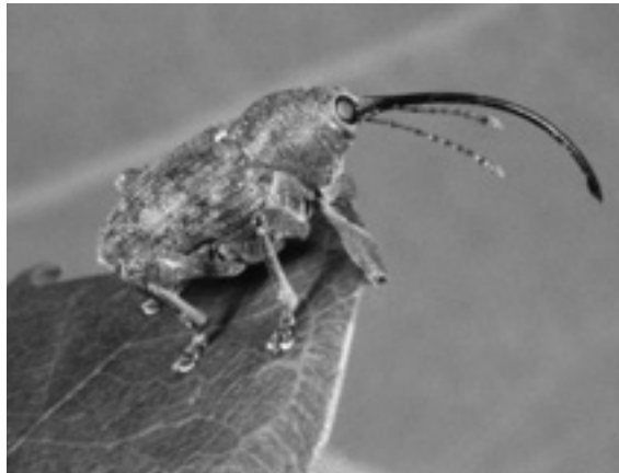
Curculio glandium Moccas - Acorn nut weevil; these insects can be so abundant that they destroy the entire crop but usually are found in small numbers. This could change if climate alters

More influential than any of the animals and insects mentioned above are our own species. Humans have interacted with trees, cutting, planting, managing and even revering them for millennia. In Britain two of the oldest traditions are associated with the ancient Fortingall yew near Aberfeldy, and the Glastonbury Thorn, supposedly descended (by cutting after cutting)