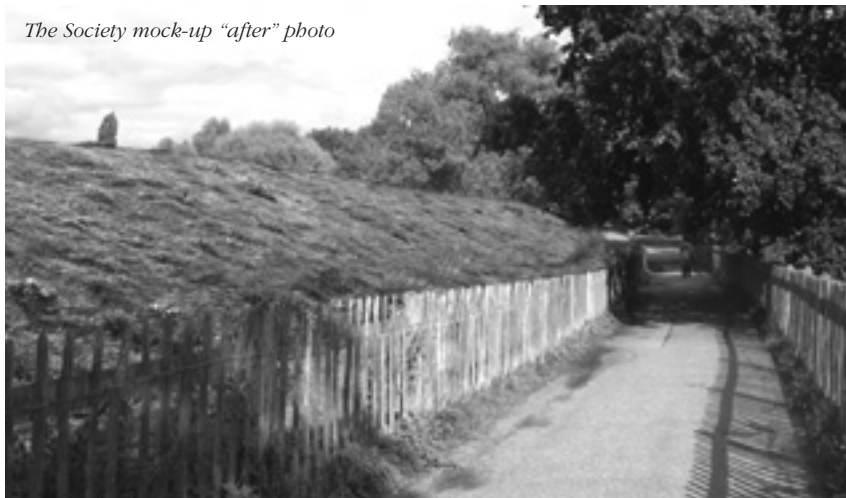
The Society mock-up "after" photo

I cannot leave this topic without drawing members' attention to a small moral victory we achieved in relation to our celebrated DamNonsense campaign postcard. In circumstances where at the time (November 2013) the City had not produced any mock-up photos, the Society felt obliged to do its best to produce one in order to alert the public to the scale of what was coming. In the High Court, the City and Atkins forcefully attacked our mock-up "after" photo - reproduced below - as inaccurate and "not a true likeness" of the new dam on the Boating Pond, although they did not produce their own "after" photo from the same close-by viewpoint.