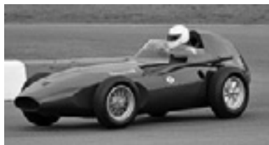
1958 Vanwall Formula 1 racing car