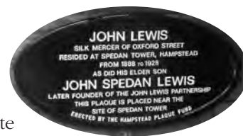
One of the Society's plaques

Progress is being made to arrange for additional plaques to be put up to commemorate well-known people who have lived in Hampstead. We would hope to be able to unveil two or three new plaques over the next few months.