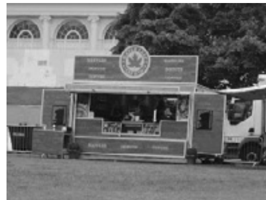
Photos of the scenes at Kenwood

Heath sub-committee members examined the terms of the licence and will be querying whether there was any breach, in particular the management of sound, the placing of bars and food outlets in front of the house which is contrary to the licence, and the use of on-site parking.