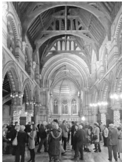
The view from the other end