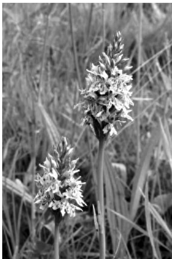
The common spotted orchid