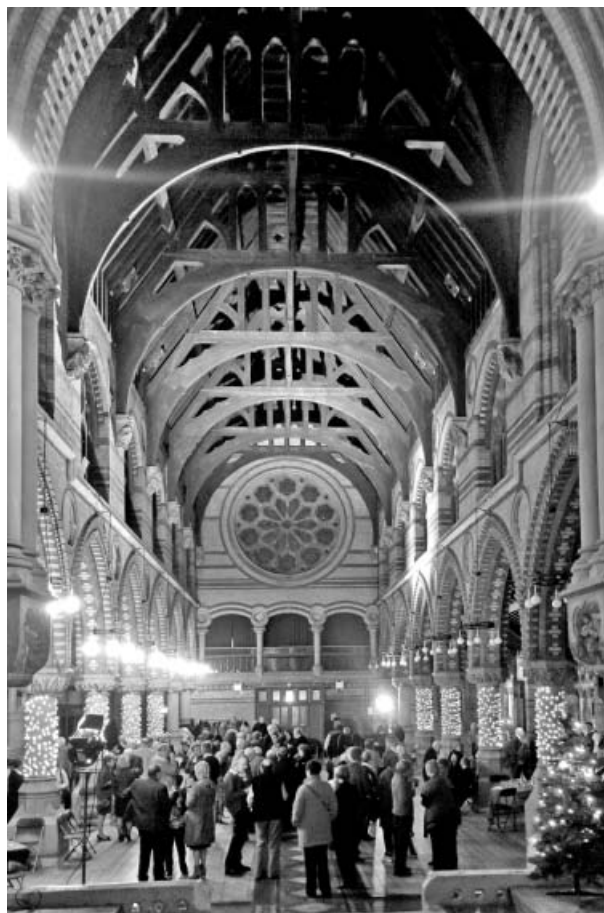
Members enjoying the Christmas party at St. Stephen's