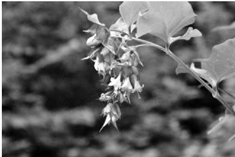
Leycesteria formosa or Himalayan honeysuckle