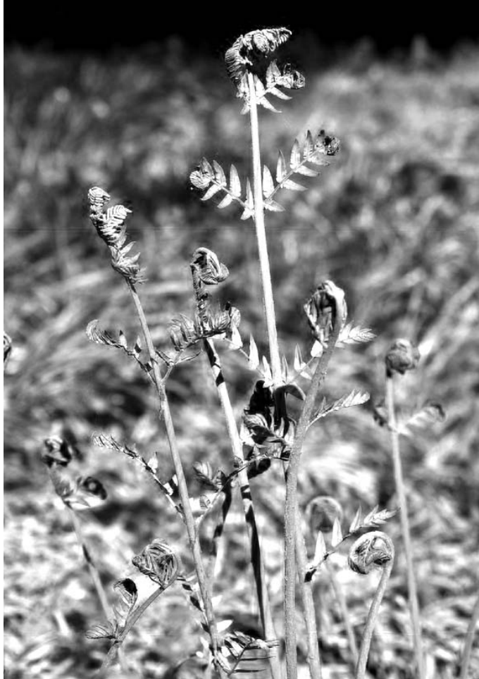
The royal fern

As a result, the heathland was slowly lost as coarse grasses, shrubs and young trees became established and added nutrients to the soil. Today the Heath has become a mosaic of acid grassland, ponds, scrub and secondary woodland and its flora reflects these changes.