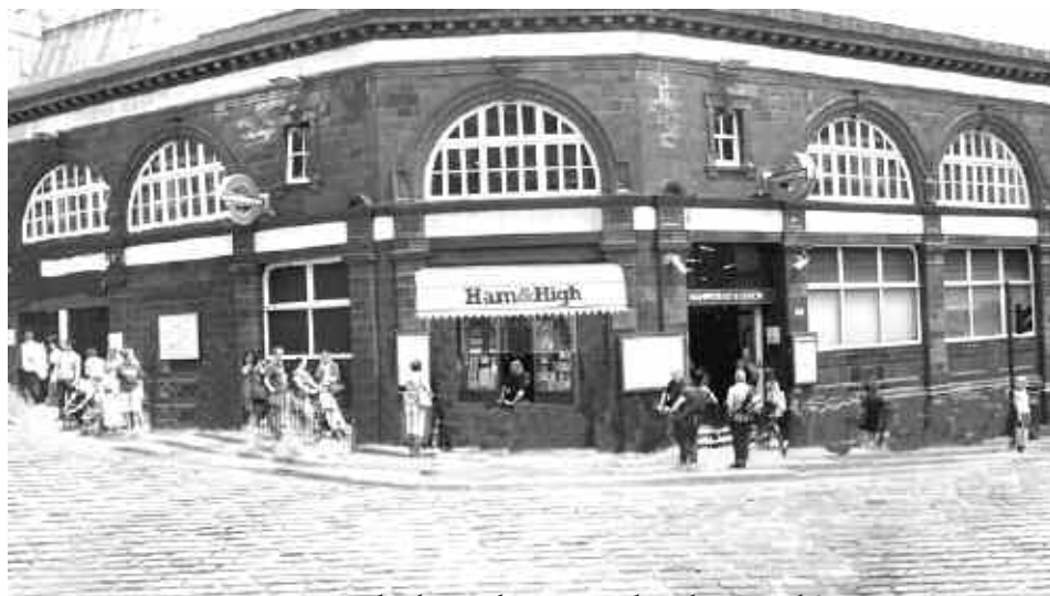
Future vision: de-cluttered Hampstead Underground Station

The images in the presentation clearly illustrate that the precious character of Hampstead is eroding. The High Street and its environs are submerging beneath all the unnecessary traffic signs, ugly street furniture, A-boards, and uncollected rubbish. Many of the shop fascias conflict with the historic architecture, while the buildings above look shabby. Traffic chokes the roads, and the place hardly looks like a conservation area!