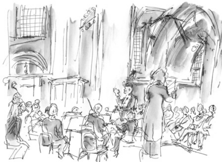
Prom leaflet front cover illustration

star of this year's H&H Festival Finale, has twice given one of these.) There will also be opportunities to discover unexpected delights of Hampstead Garden Suburb through guided walks led by experts in architecture, town planning and local history, and a strawberry tea in aid of the Hospice on the afternoon of Friday 16 June.